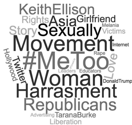
Figure 3. Tag cloud obtained in the NVivo analysis.